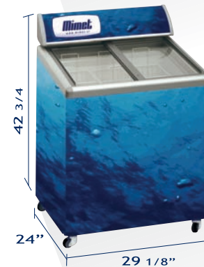
BV-200IA Angled top cooler with sliding tempered flat glass lids with lock