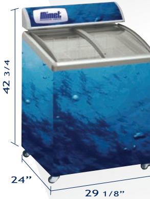
BV-200ICA Angled top cooler with sliding tempered curved glass lids with lock.