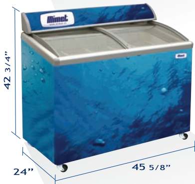
BV-350ICA Angled top cooler with sliding tempered curved glass lids with lock