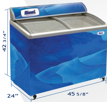
CV-350ICA Angled top freezer with sliding tempered curved glass lids with lock.