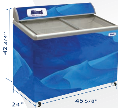
CV-350IA Angled top freezer with sliding tempered flat glass lids with lock.